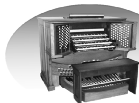
RODGERS® DIGITAL ORGANS PIPE-COMBINATION ORGANS

New 4 Manual Console to be interfaced with 45 Rank Casavant Pipe Organ at Sligo Seventh Day Adventist Church Takoma Park, Maryland